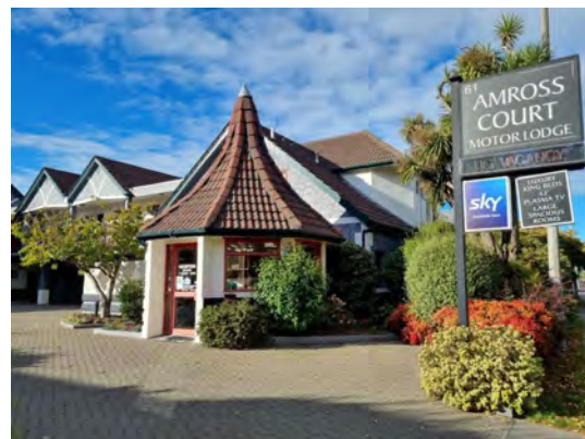
AMROSS COURT MOTOR MOTEL 2.3 KM FROM THE RICHMOND CLUB