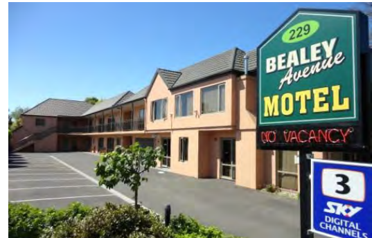
BEALEY AVENUE MOTEL 2 KM FROM THE RICHMOND CLUB