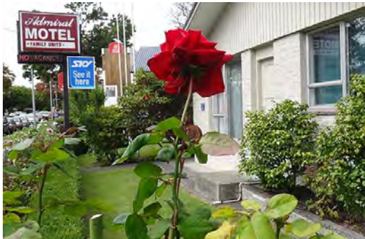
ADMIRAL MOTEL 1.6 KM FROM THE RICHMOND CLUB