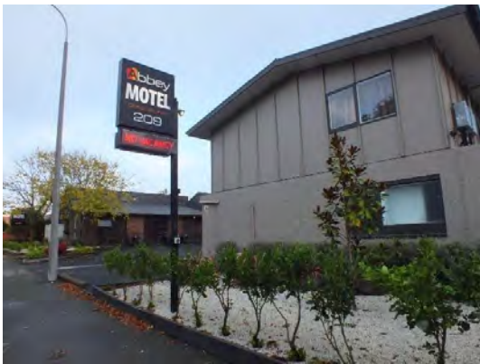
ABBEY MOTOR LODGE 1.9KM FROM THE RICHMOND CLUB

We are lucky to have plenty of accommodation nearby. Bealey Avenue is within 10 minutes walk from Richmond Club and has plenty of accommodation to suit all tastes from luxury to budget.